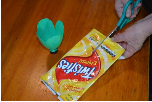
Figure 7: Cut the chip packet in half lengthways.