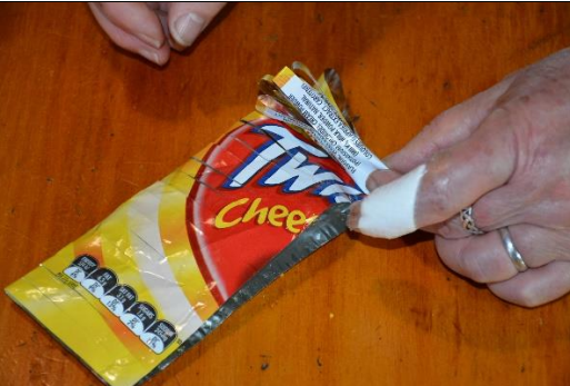
Figure 11: Roll up the chip packet