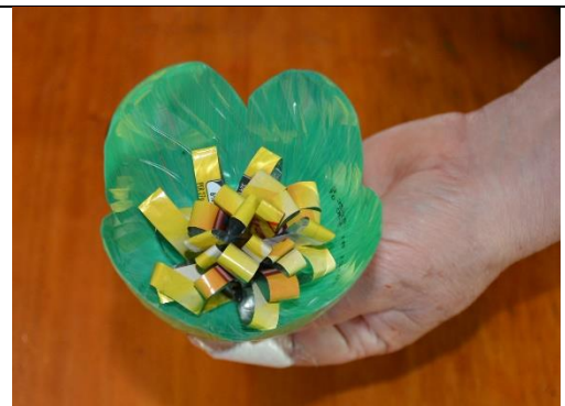
Figure 13: Place the rolled packet into the bottle