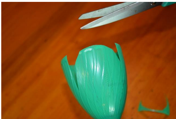
Figure 5: Trim the cut sections into a petal shape.