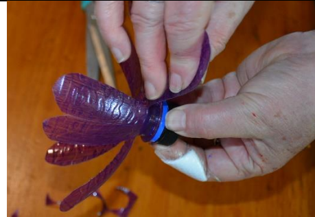
Figure 18: Shape petal sections and bend them down