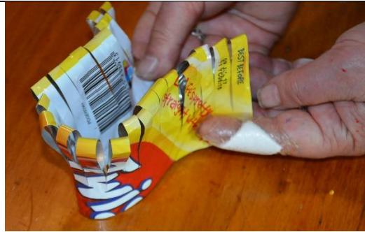
Figure 10: After cutting strips