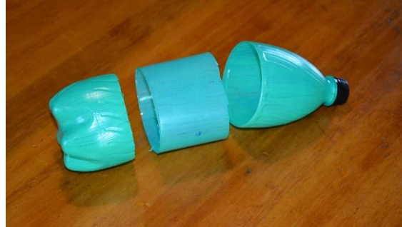
Figure 2: Paint bottle, and then cut into three pieces. Keep the top of the bottle and put the other pieces aside for another project.