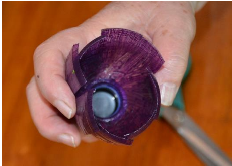
Figure 17: Make eight cuts