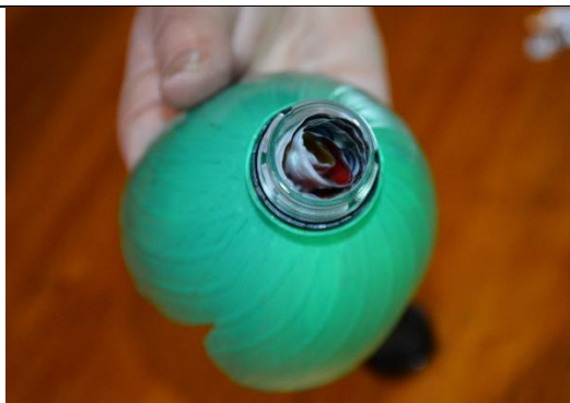
Figure 14: Use hot glue to hold packet and bottle lid in place