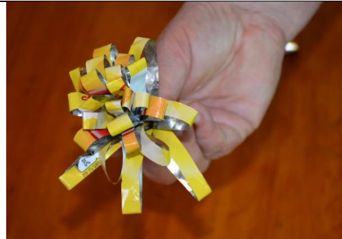
Figure 12: Continue and fold complete strip