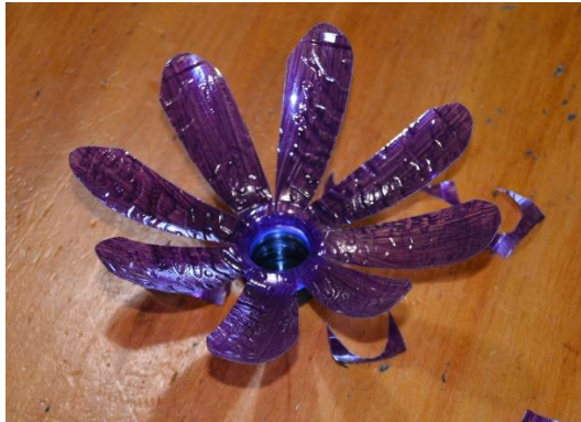
Figure 19: Completed shape