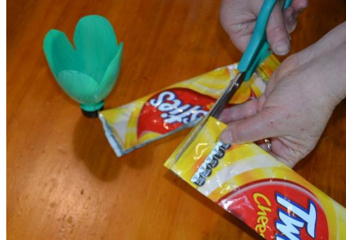
Figure 8: Cut off bottom seam and discard