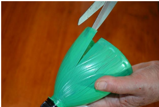
Figure 3: Make a cut in the top of the bottle.