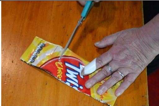
Figure 9: From the folded edge, cut narrow strips half way