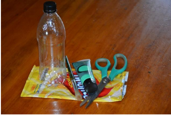
Figure 1: Bottle, paint and brush, chip packet, scissors.