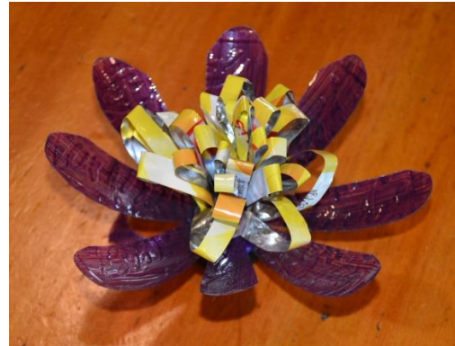
Figure 20: Insert chip packet as before and glue into lid