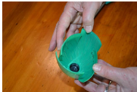
Figure 4: Make three more equal cuts.