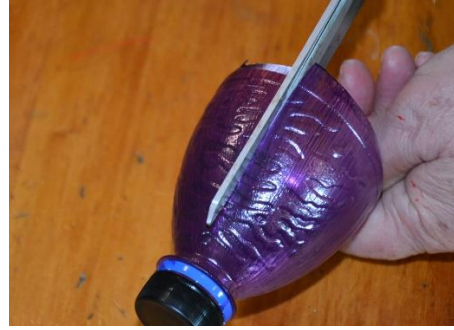
Figure 16: Variation – make deeper cuts into top of bottle