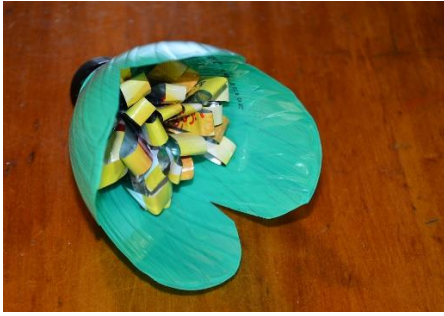
Figure 15: Completed flower