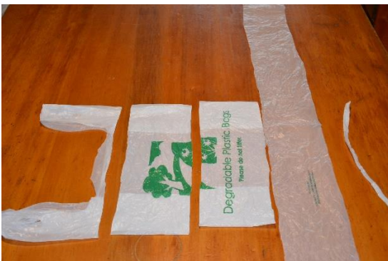
Figure 5: Open out strip