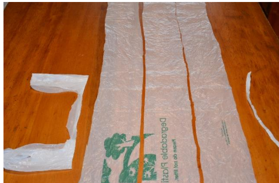
Figure 6: Do the same for other strips: