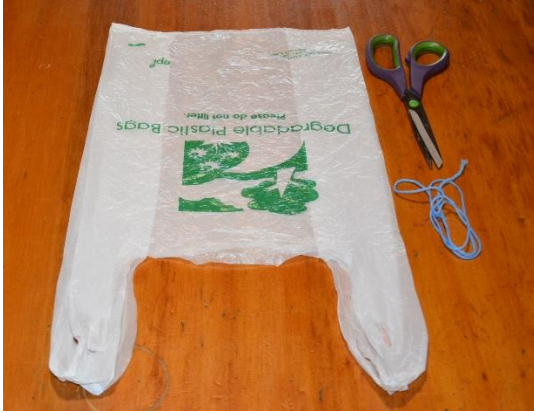
Figure 1: Bag scissors yarn/string