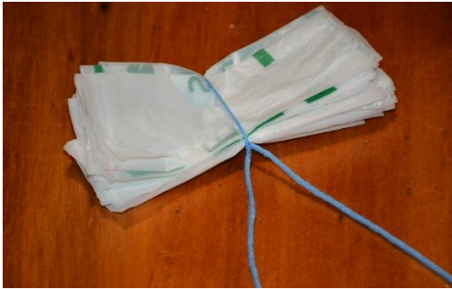
Figure 15: Completed knot, keep long tails of yarn