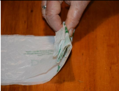
Figure 11: Close up of folds