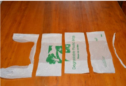
Figure 3: Bag cut into strips