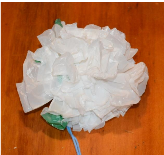
Figure 19: Completed flower