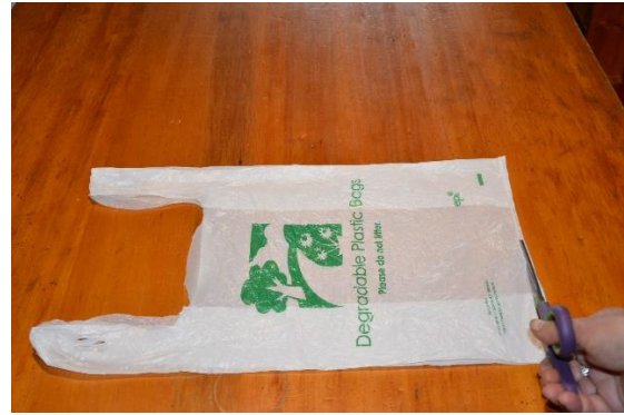
Figure 2: Remove bottom seam and handles