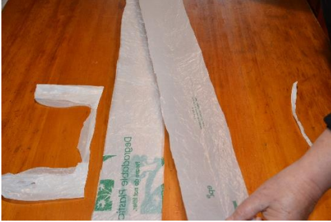
Figure 7: Place three strips on top of one another