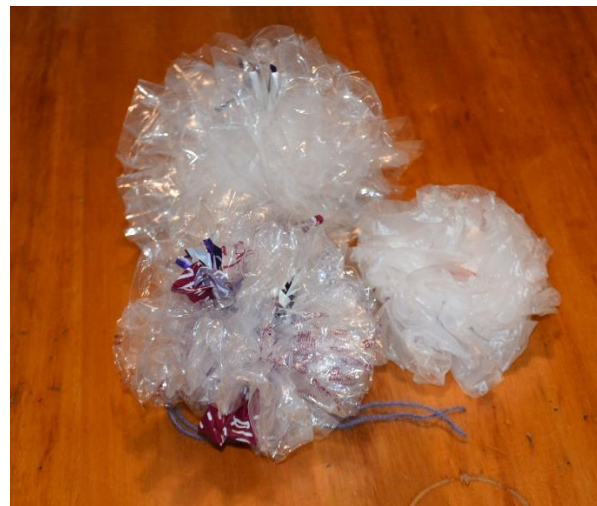
Figure 20: Flowers made from clear plastic bags