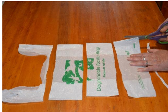
Figure 4: Cut one side of bag