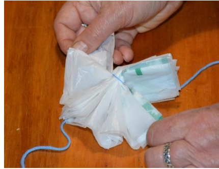
Figure 16: Begin to separate each fold