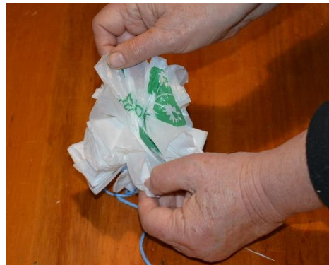
Figure 18: Continue to separate each strip