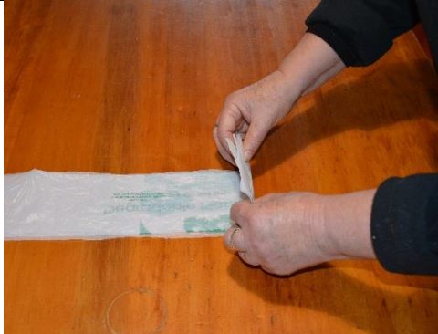
Figure 9: Fold the strips with concertina folds