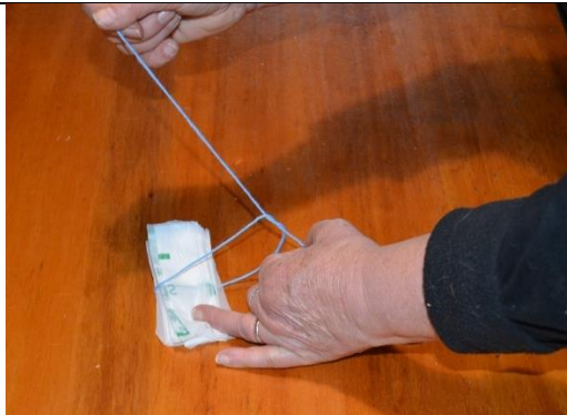
Figure 14: Tying knot