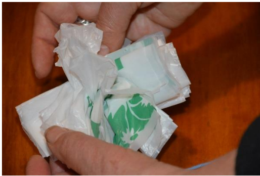
Figure 17: Separate each strip by pulling upwards