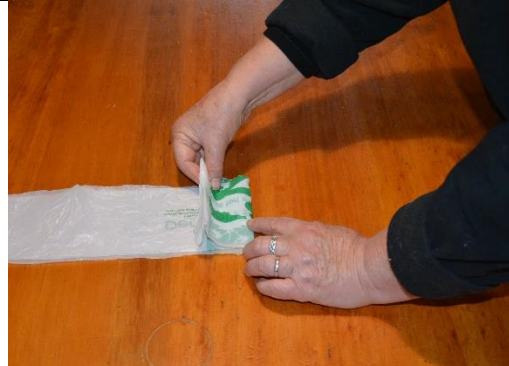
Figure 10: Concertina folding