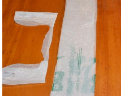
Figure 8: Keep bag handles and bottoms for another project