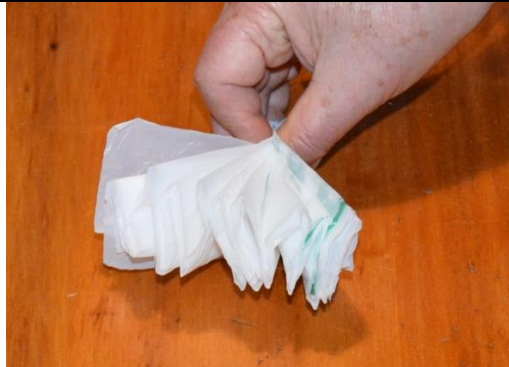
Figure 12: Continue and fold complete strip