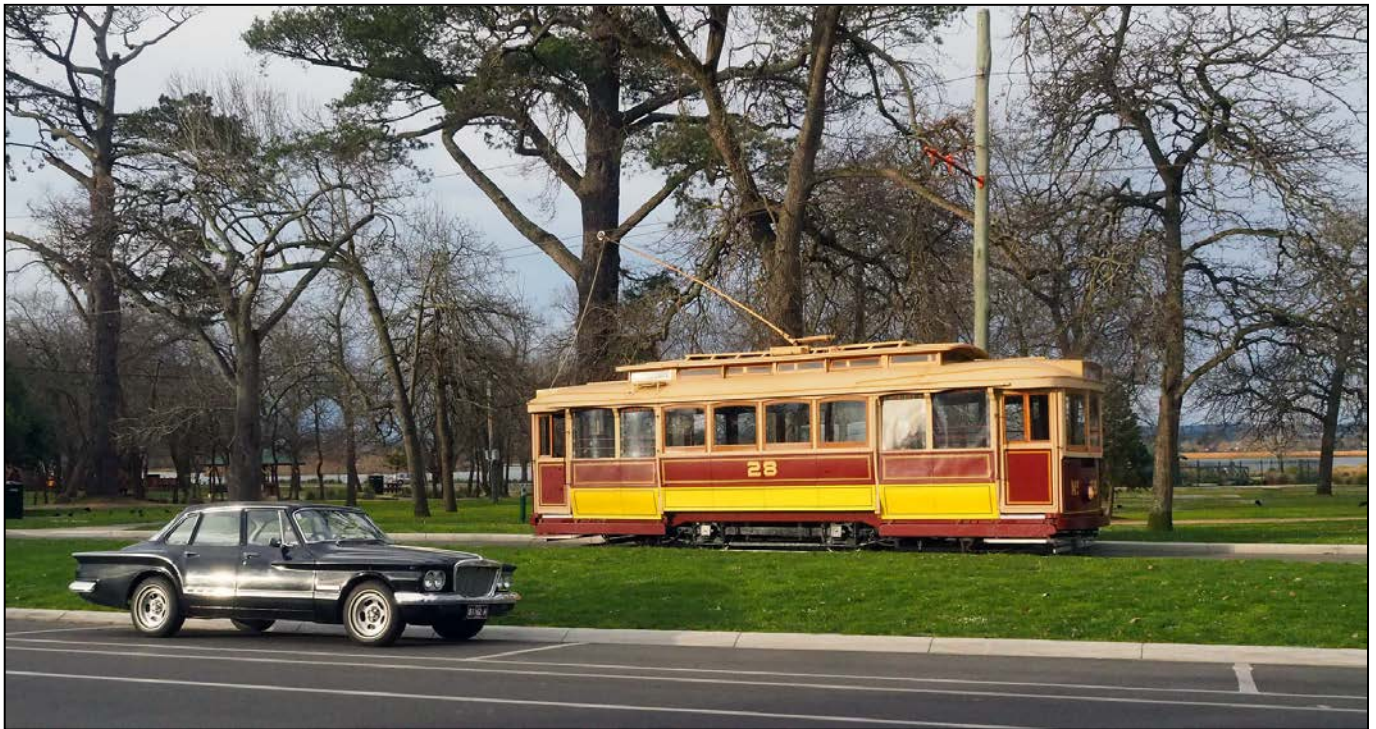
Valiant & No 28