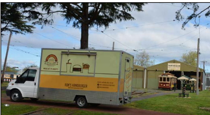
Hamburgers arriving and the uneaten ones departing. 5/10/17