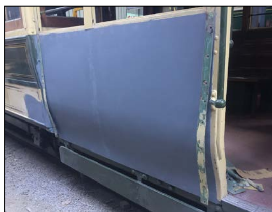
Above: New side panel for No 27.